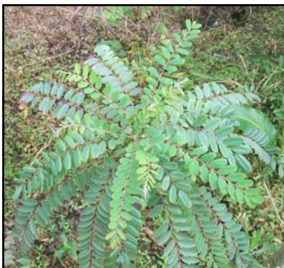
Mexican alvaradoa is listed as endangered in the State of Florida.

Mexican alvaradoa is a wonderful plant now finding its way into cultivation. Slender and upright with an open crown, this small tree has delicate opposite thin leaves on single branches. It normally reaches 10 to 20 feet tall depending on growing conditions. What are most unusual are its flowers. Hanging down on long stalks are numerous white flowers, which are tightly bunched on what just appears to be spiky thorns. For the wildlife, it's always best to have some plants in your garden that flower when others are not. The Mexican alvaradoa blooms from fall to spring. As an added feature it is the host plant for the small, fast moving Dina Yellow butterfly.